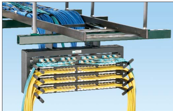
Mounted to center rung below and perpendicular to ladder rack