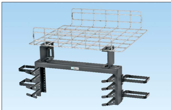
Mounted below and parallel with cable tray