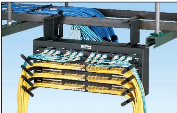
Mounted to side rail below ladder rack

Shown with zero rack unit cable manager, PZBR4